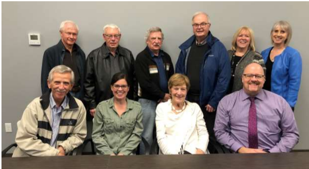
Volunteer Appreciation – Many of the volunteers in our Youth Justice Committees were recognized for their contributions. Some have been with us for over 15 years!

-Parent of a client in the Supervised Independent Living Program