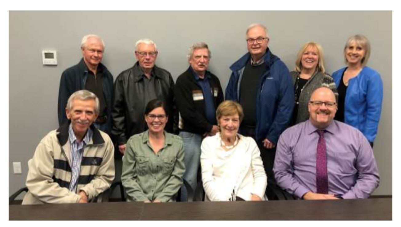
Volunteer Appreciation – Many of the volunteers in our Youth Justice Committees were recognized for their contributions. Some have been with us for over 15 years!

-Parent of a client in the Supervised Independent Living Program